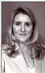
HAYLEY WICKENHEISER HOCKEY